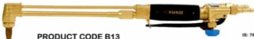
PRODUCT CODE B13