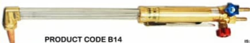
PRODUCT CODE B14