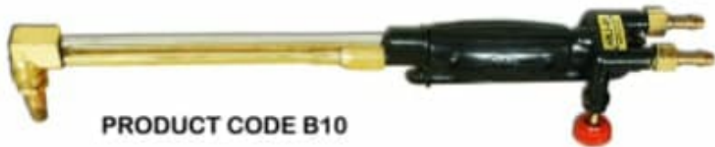
PRODUCT CODE B10