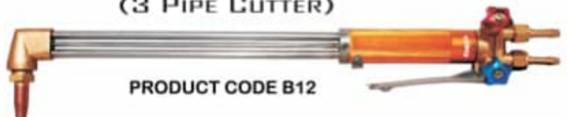
PRODUCT CODE B12