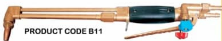
PRODUCT CODE B11

Body, head & socket made by pressure casting . Mixing pipe made by extruded brass rod . All pipes are of heavy gauge brass . Brazing done by 25% silver rod .